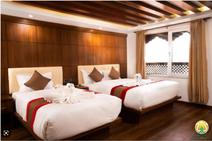
HOTEL KAILASH KUTEE (2 NIGHTS)